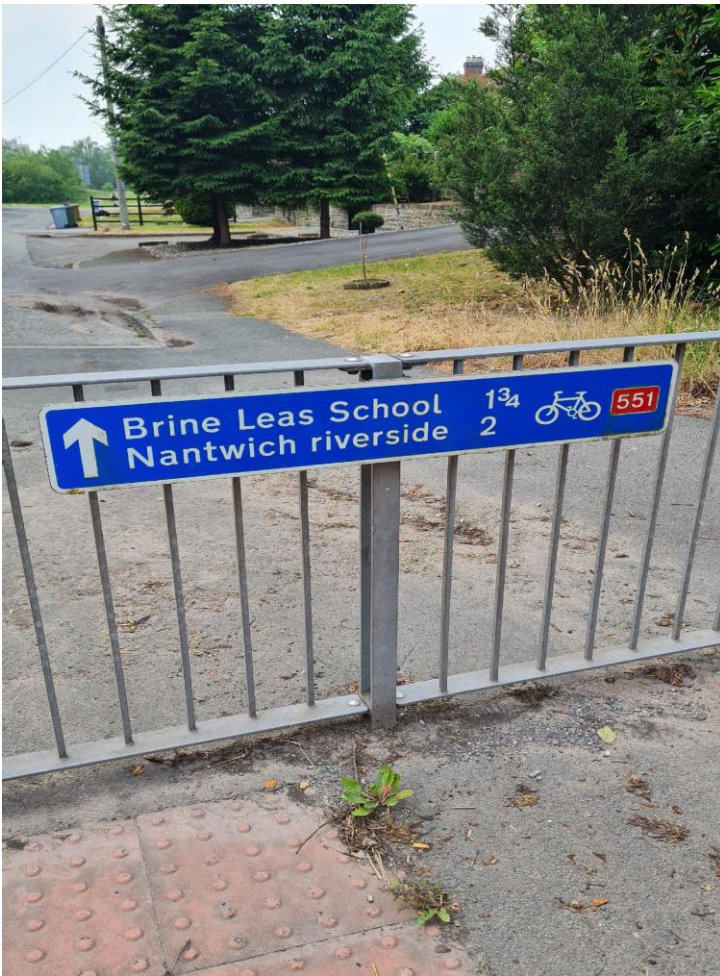
Access to Newcastle Road