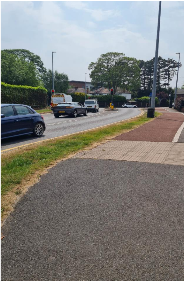
Peter Destaplegh Way