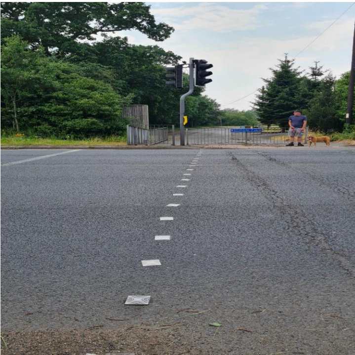
Toucan Crossing on Cheerbrook Road